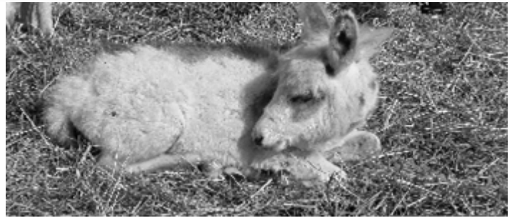
"Precious Gem," a young goat rescued at Hog Heaven

and maintenance work of the farm. Volunteers are needed to muck stalls, check fences, build and repair sheds, and help with other seasonal farm work.