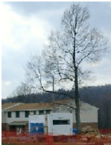
A new Living/Learning center will soon house many after-school programs at Gill Village.